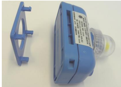
Light and Fixing clip separated to show material path.

The Dan W2 is supplied with a fixing clip. The clip is intended to be placed behind a strip of lifejacket material or reflective tape; the light is secured by pressing it into the clip.