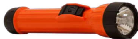
WorkSafe™ Model #2224LED